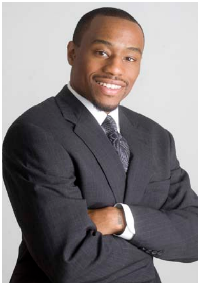
Dr. Marc Lamont Hill