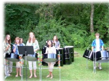
Steel Drum Band Hanover Middle School