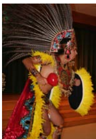
Mexican Aztec Dance Grupo Folklorico San Jose