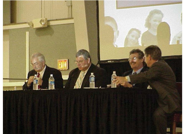
School district consolidation panel