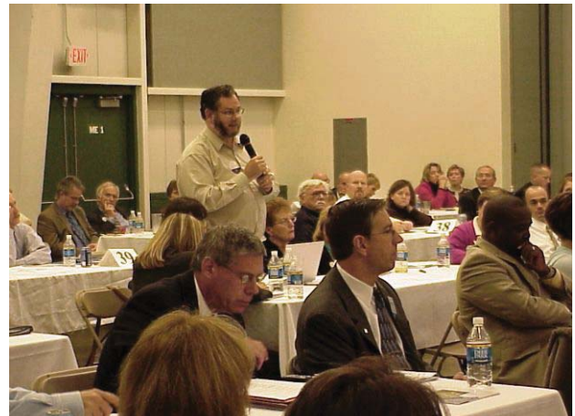
An audience member voices concern over the issues